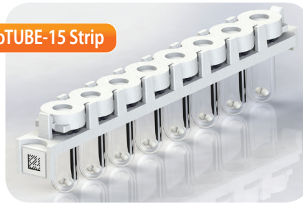
8 microTUBE-15 Strip